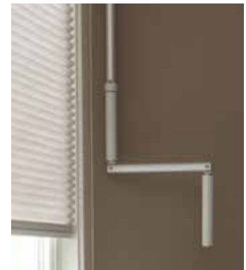
7 Crank operation