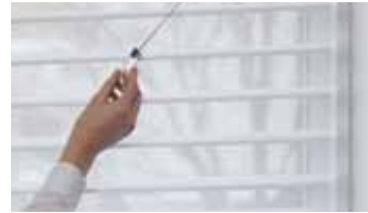
2 SmartCord® and UltraLift™