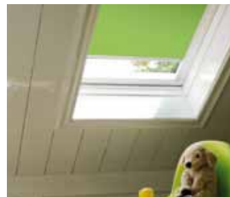
5 Skylight, Nano Blinds and tensioned models