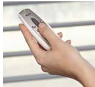
3 PowerRise® and motorized operation